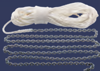
Rope chain kit

For more accessory options visit our website