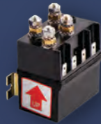
Reversing solenoid kit