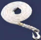
Snubber Line kit