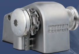
HC650 Capstan F061250