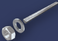
Deck mounting studs & fasteners